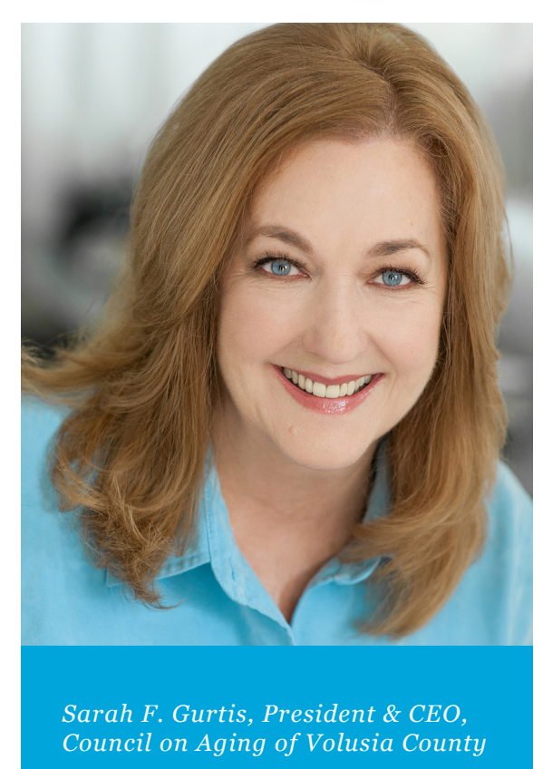
The newsletter of Council on Aging of Volusia County