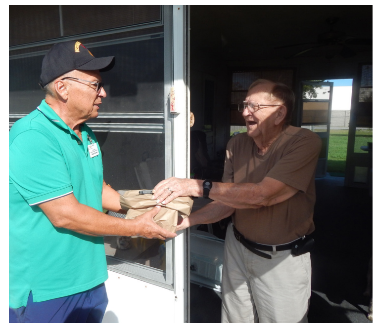
COA Meals on Wheels delivery

You may donate online at www.coavolusia.org, call 386.253.4700 x 215, or mail a check made payable to COA to 420 Fentress Blvd., Daytona Beach, FL 32114.